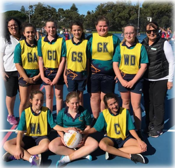
SAPSASA NETBALL GIRLS

In PE we have been focusing on learning and further developing our Fundamental Movement Skills and the skills required for successful team work and participation in various sports. Frisbee skills, aiming at targets with various sized equipment, football skills, skipping and long distance running have been the main focus since Sports Day.