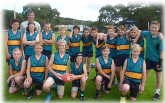
SAPSASA FOOTBALL TEAM