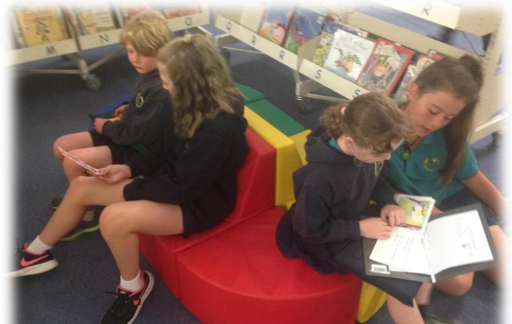
Some of our Sea Readers reading to their mentors.