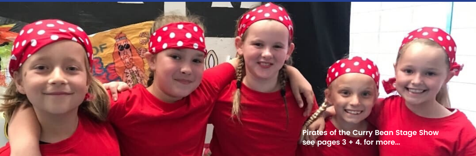
Pirates of the Curry Bean Stage Show see pages 3 + 4. for more...