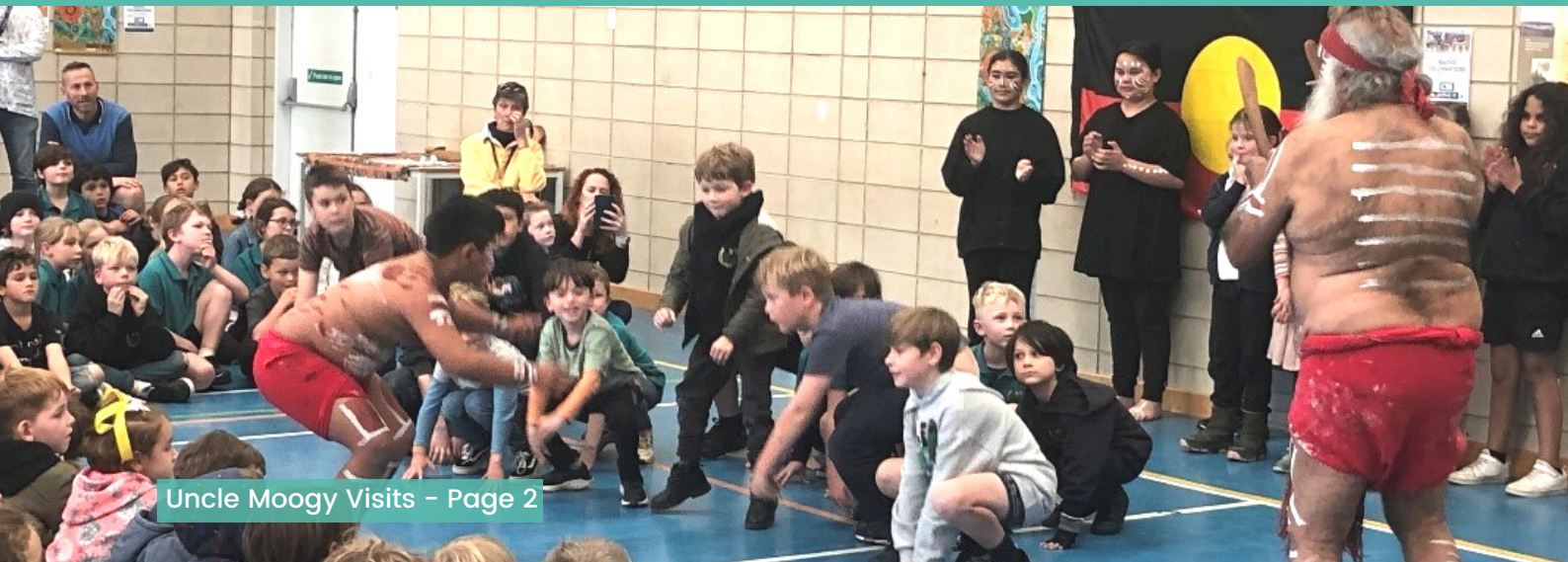
Uncle Moogy Visits - Page 2