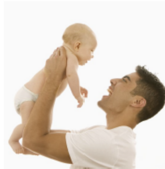
The course will cover:

Please Phone: 8555 2509 to book your place.