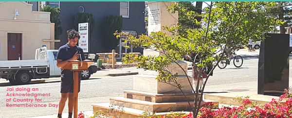
Jai doing an Acknowledgment of Country for Remembrance Day