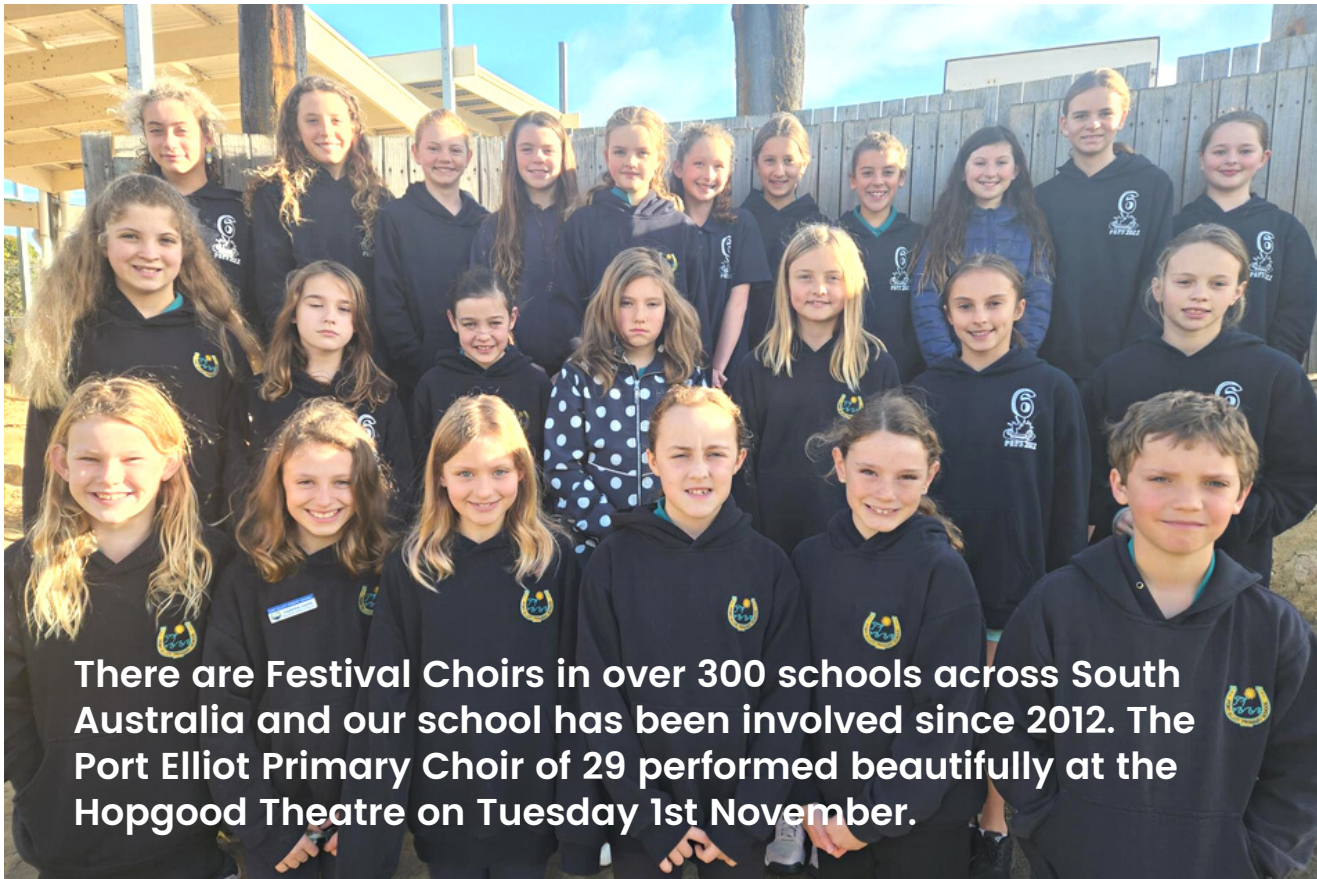
There are Festival Choirs in over 300 schools across South Australia and our school has been involved since 2012. The Port Elliot Primary Choir of 29 performed beautifully at the Hopgood Theatre on Tuesday 1st November.

I love the Festival of Music! This year I was the assistant stage manager for the Adelaide season, which is 10 performances, and a troupe coordinator for the Southern Metro season. I have personally been involved in this Festival for 23+ years.