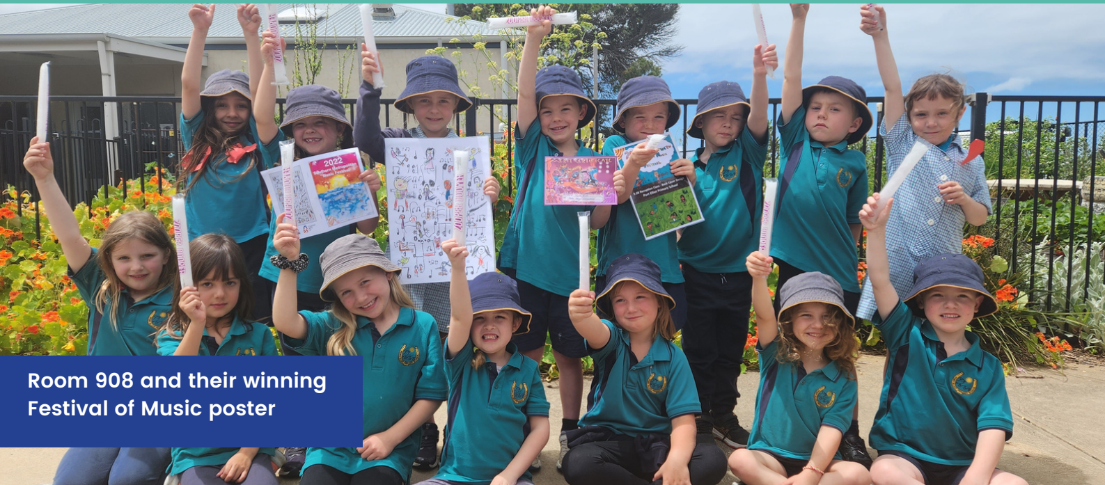
Room 908 and their winning Festival of Music poster