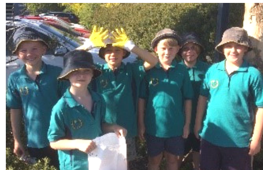
Mr Taylor's class cleaned up Hunter's Garden

Well done to all of the classes who participated. Every bit of rubbish picked up makes a big difference to our environment.