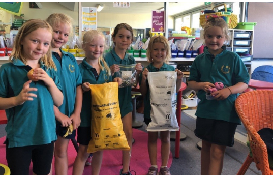
Ms Lacey's class filled two bags of rubbish

Well done to all of the classes who participated. Every bit of rubbish picked up makes a big difference to our environment.