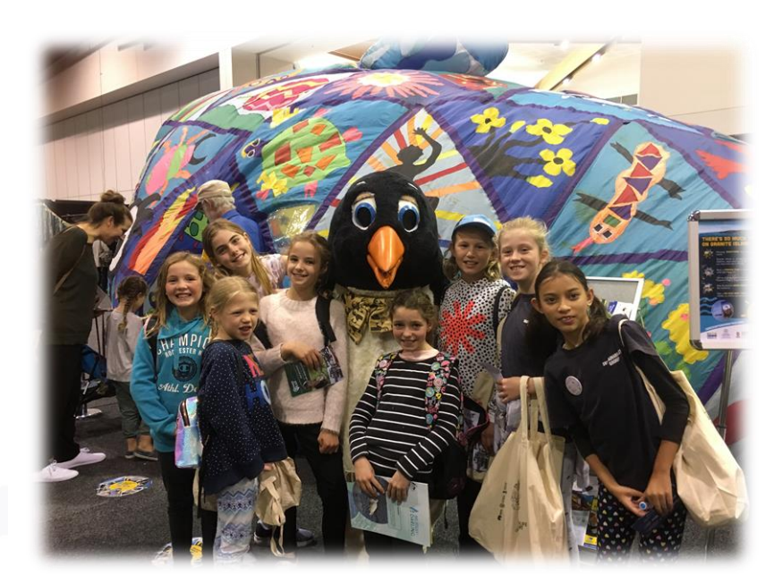
Sustainability Group celebrating World Environment Day