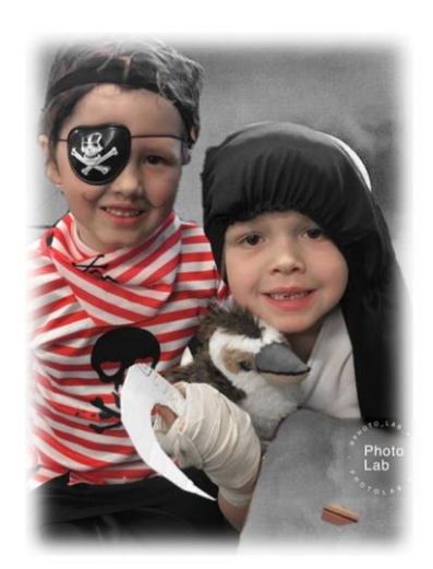
Teachers and SSO's enjoyed the chance to dress up as well for the day.