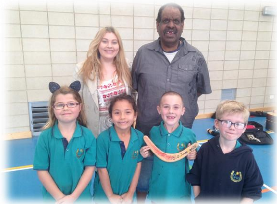
Students enjoying Naidoc week celebrations.